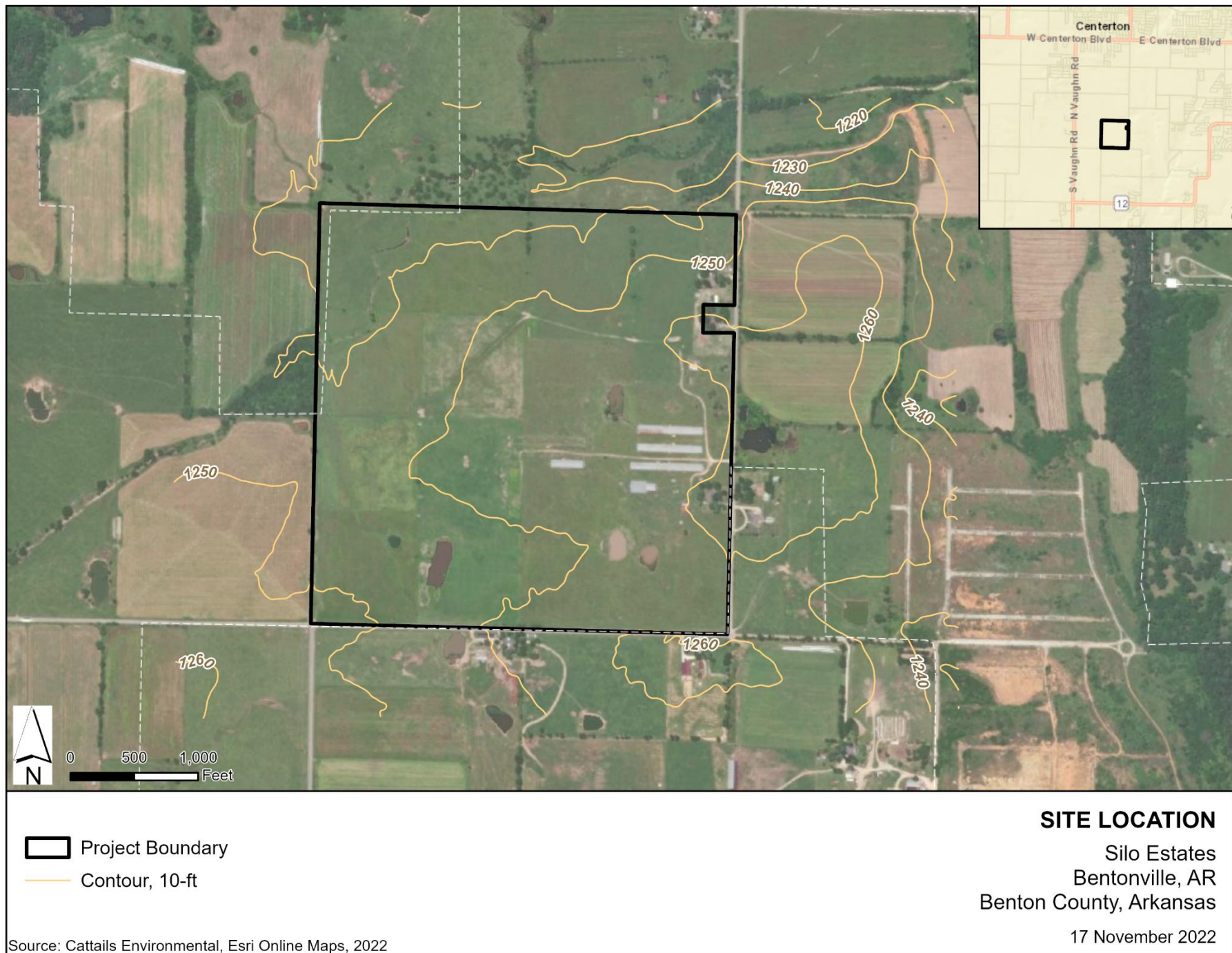
Figure 1-1. Site Location Map for the Silo Estates, Proposed Subdivision, Bentonville, Benton County, Arkansas.